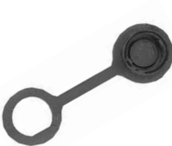
Dust Cap 16295