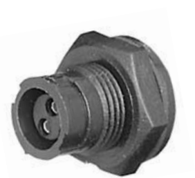
Panel Mount 1728X-XXB-XXX Matching Mates: • Cable Pin 1628X-XPB-XXX • Cable Socket 1628X-XSB-XXX