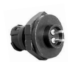
P/C Tail Panel Mount 172XX-XXB-XXX Matching Mates: • Cable Pin 1628X-XPB-XXX • Cable Socket 1628X-XSB-XXX